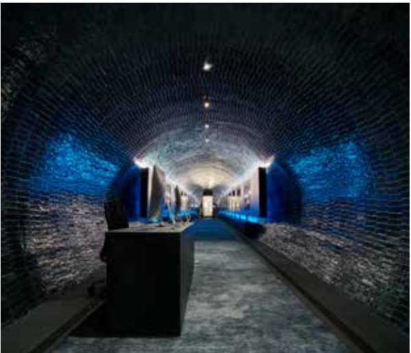
Archea Associati, Rifugio Digitale, Florence, 2022