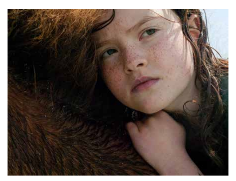
The young girl in Ao, 2021, Charlotte Dumas