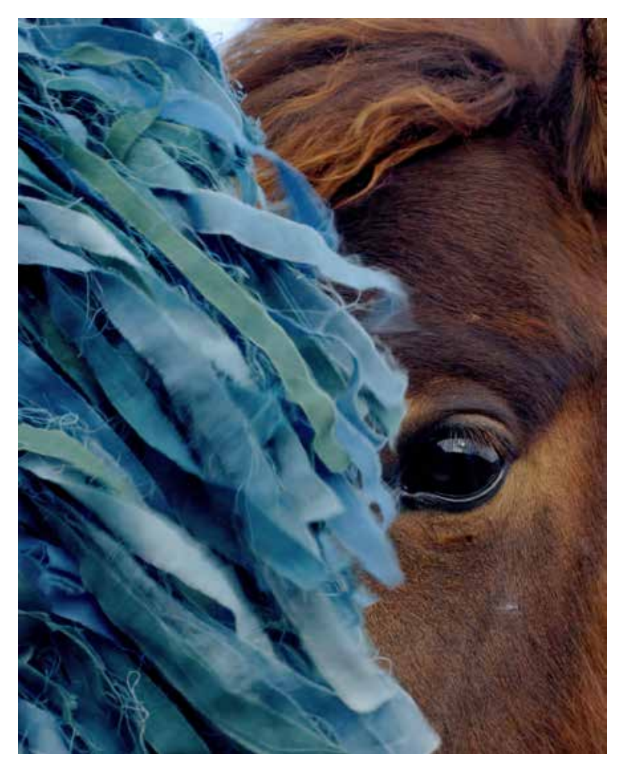
Horse waiting, Charlotte Dumas