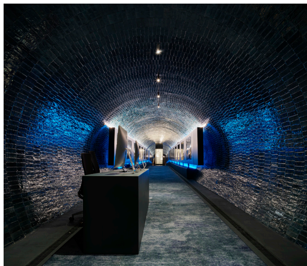
Archea Associati, Rifugio Digitale, Florence, 2022