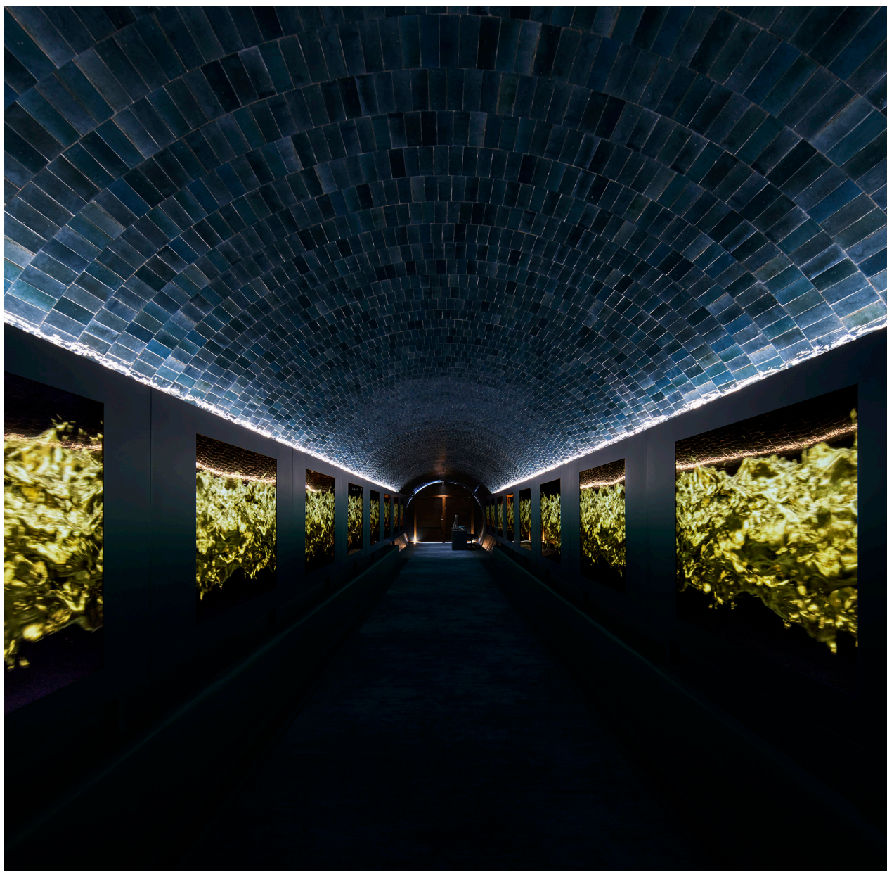
Archea Associati, Rifugio Digitale, Florence, 2022